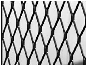
Expanded Metal Fencing