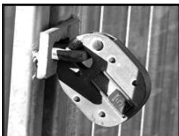
Closed Shackle Lock

It is important that key control is exercised so that keys can always be accounted for and they should be stored securely when not in use. Do not be tempted to leave a spare key in a convenient hiding place – an offender can quickly find and use keys 'hidden' in this way. It is much better to leave a spare set of keys with a neighbouring farmer – you could offer to do the same for them.