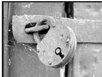
Open Shackle Lock