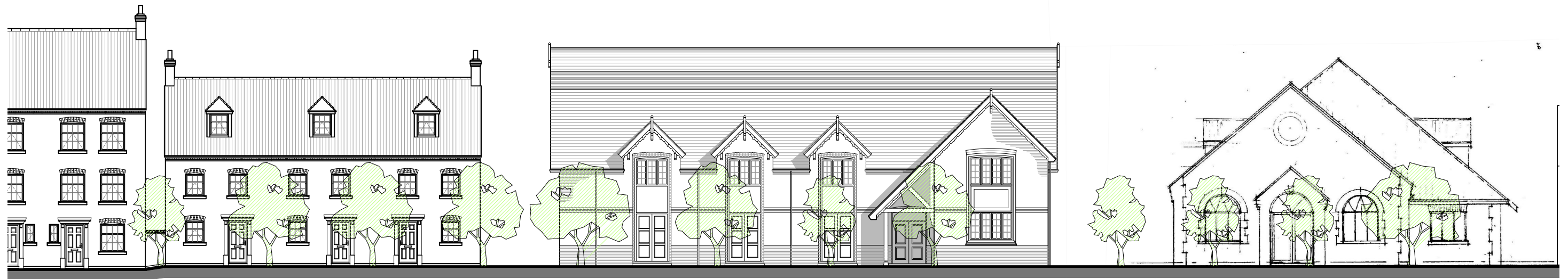
Housing (Area H9)